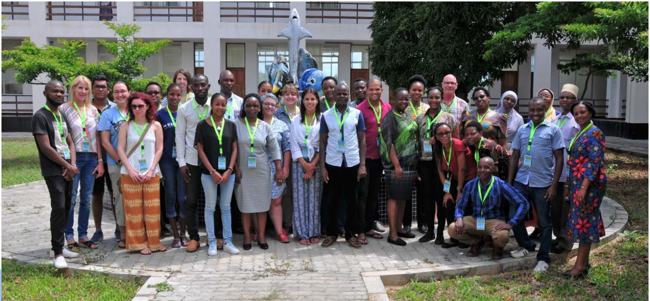
Workshop participants and trainers at the IMS Buyu Campus, Zanzibar

This week-long workshop focused on identification of zooplankton and ichthyoplankton, with both theoretical and practical training. Plans are underway for the production of additional resources viz identification guides. The legacy of such a training program, apart from trained personnel, is the development of infrastructure such as new high resolution stereomicroscopes suitable for zooplankton and ichthyoplankton analysis that will help sustained observations in the future.