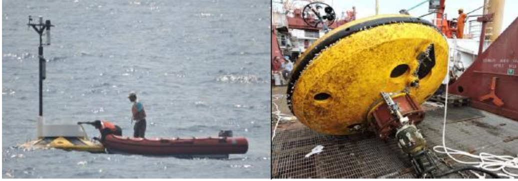
Figure 3: NIOT engineers trying to establish a working line in the BD11 buoy (right panel) and the BD11 buoy onboard (left panel).