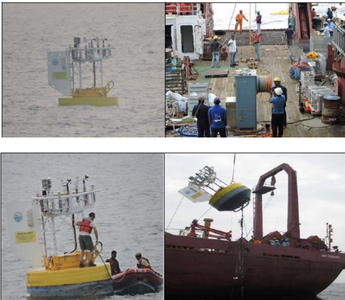
Figure 2: from top right: TR: WHOI mooring sighted, TL: deck operations in full swing to recover the yellow glass balls, BR: Establishing working line with the buoy for the recovery and BL: recovering the buoy.

We crossed over from the downwelling eddy to the upwelling eddy at around 87.5 longitude along 20°N latitude, which marked upsloping of the isopycnal contours. Over the upwelling eddy, the thermal inversions are very weak and confined more to the surface layers. Over the course of our upper ocean survey, we crossed many strong frontal structures with spatial density gradients ranging from 0.4kg/m 3 to 1kg/m 3 over distances of 4km to 15 km.